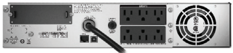
[ SMT1500RM2U ]