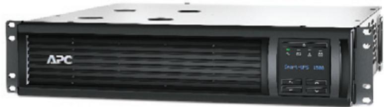
[ SMT1500RM2U ]