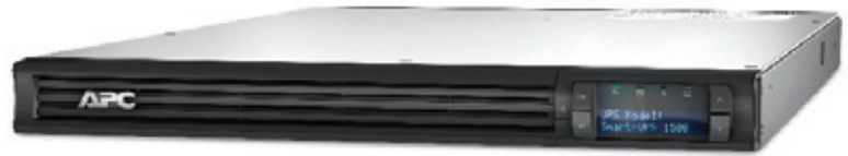
[ SMT1500RM1U ]

Application-optimized standard models, ideal for servers, storage, point-of-sale, and other network devices