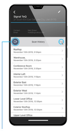
Easily export your system design projects as .csv files for use in Excel.