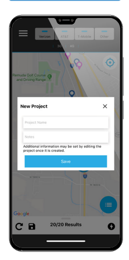
Customize, organize, and save all of your installs to the cloud for safekeeping.