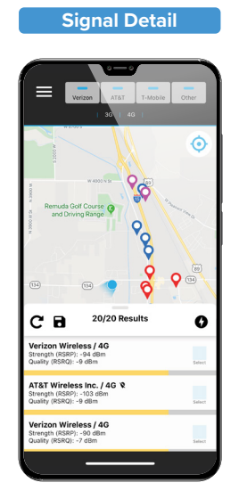
Select any tower to display signal quality, carrier, band, DL frequency, and more.

For ease of use, the scanner pairs with the Cell LinQ app from WilsonPro for simple access to your data. The scanner stores the data in the cloud, with options for exporting into an excel file.