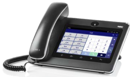
GT890: IP Desktop Video Telephone