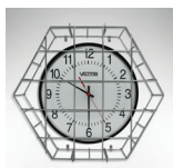
Wire Guard for Analog Clocks V-WGACKL