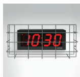
Wire Guard for Digital Clocks V-WGD4