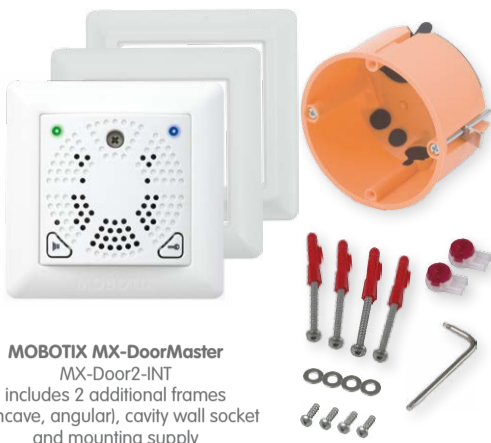
MOBOTIX MX-DoorMaster MX-Door2-INT includes 2 additional frames (concave, angular), cavity wall socket and mounting supply