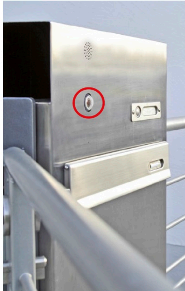
The S15M is a single-lens Hemispheric video device that mounts discreetly behind surface panels.

Technical specifications subject to change without notice