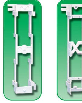
S89B S89D Stand-off Mounting Brackets